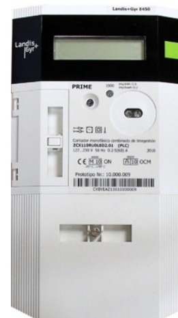
Figure 3: Interoperable PRIME meter based on the evolving PRIME PLC-technology and standard IEC 62056 (DLMS/COSEM)

The examples above show that it is possible to achieve interoperability based on open standards provided that there is the necessary commitment from the utilities to investing in it. It must be noted that even though the companion specifications of the two projects differ, they are both based on the same standards. This makes it easier to attract a variety of manufacturers that can use many of their equipment parts in both projects and therefore profit from economies of scale.