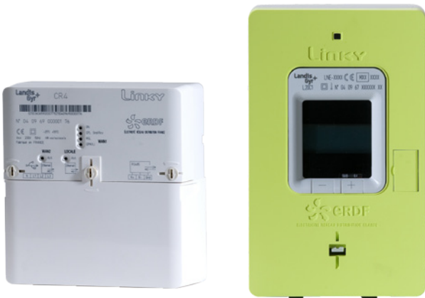
Figure 2: Interoperable LINKY equipment based on standards IEC 61334 (S-FSK PLC-technology) and IEC 62056 (DLMS/COSEM)

The examples above illustrate that larger utilities have the resources required to commit to interoperability.