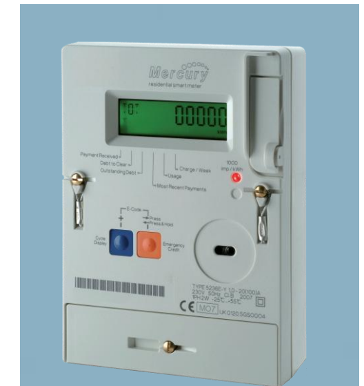
5236 Tokenless Smart Prepayment Meter