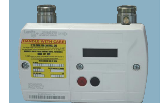
Libra 310 Gas Meter