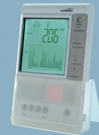
ecoMeter In Home Display Monitor